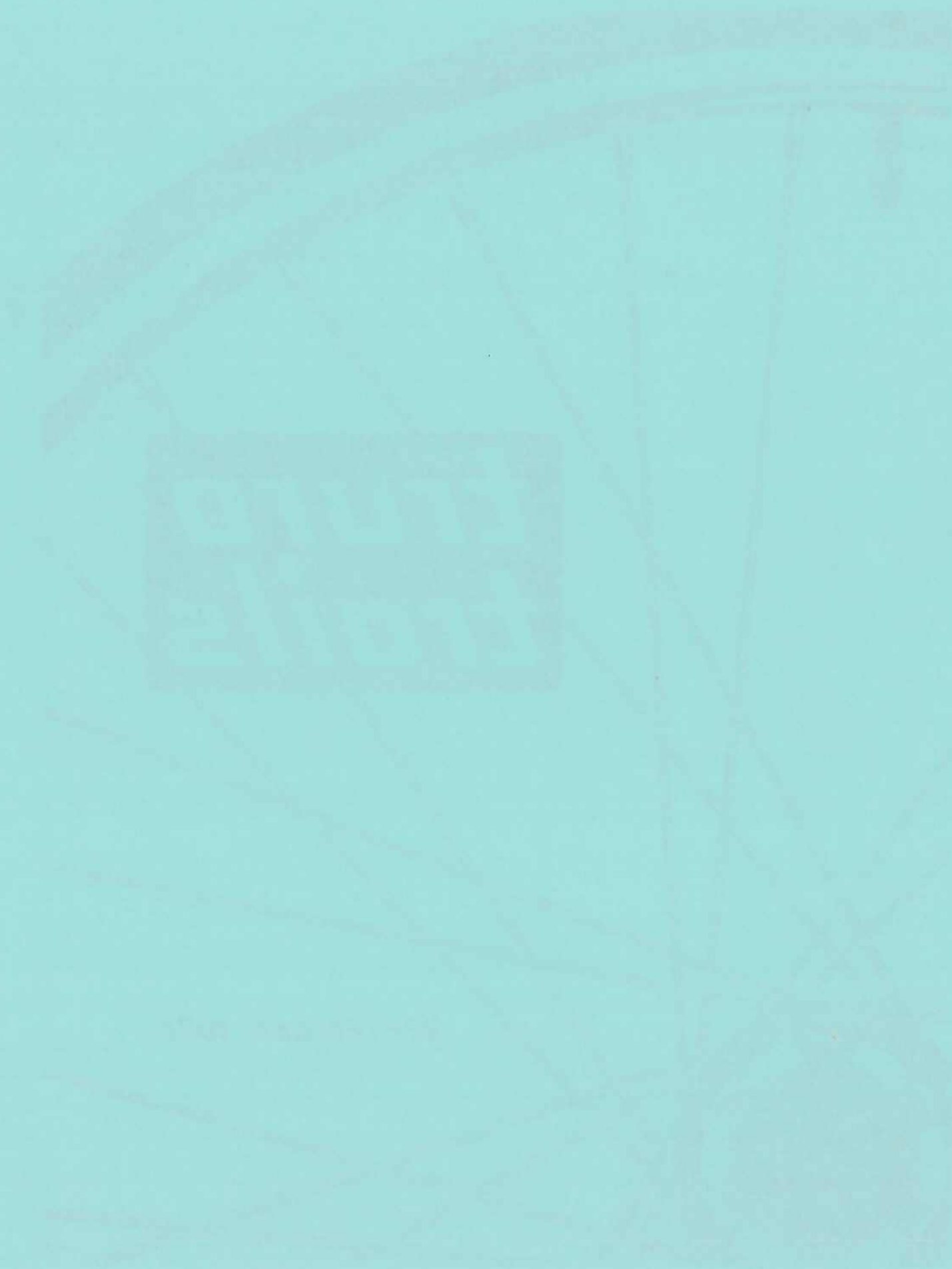
FIG. 1. Contour plot of the correlation coefficient between the 2003–04 winter precipitation anomaly and the 2003–04 winter precipitation anomaly. The contour interval is 0.2. The shaded area is the region where the correlation coefficient is greater than 0.4.