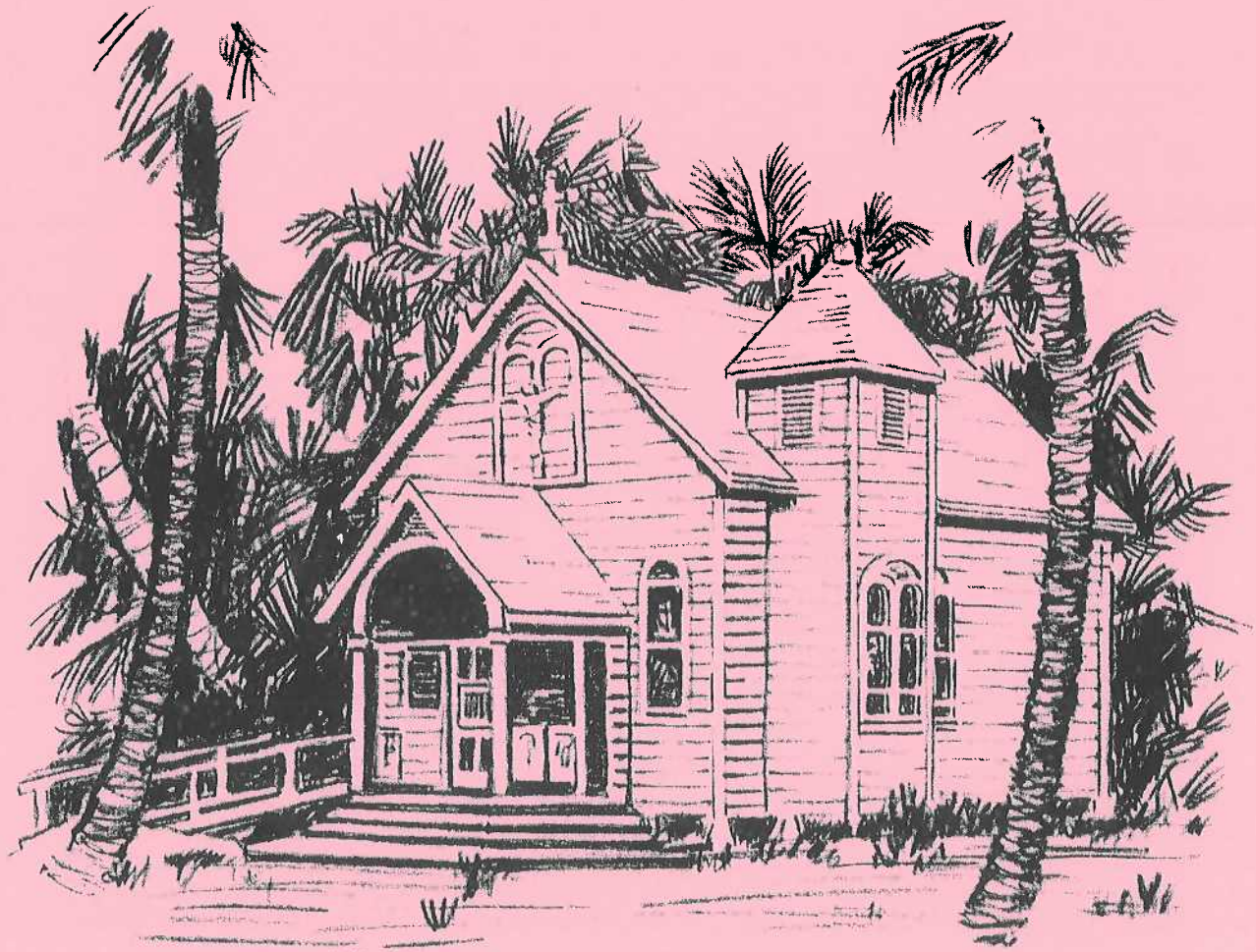
Star of the Sea Church, Hawaii