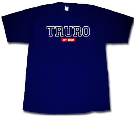
Navy T-Shirt, red block 1968 w/white lettering

If paying by check, please make payable to: Truro Homes Association (THA)