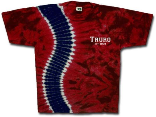
Crimson, White & Blue Tie Dye w/white lettering

Please make check payable to: Truro Homes Association (THA).