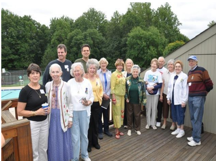
Truro original owners at 40th