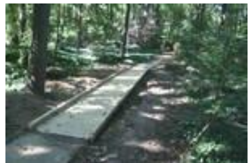
Figure 2 - The finished walkway!